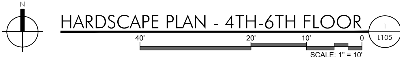
HARDSCAPE PLAN - 4TH-6TH FLOOR